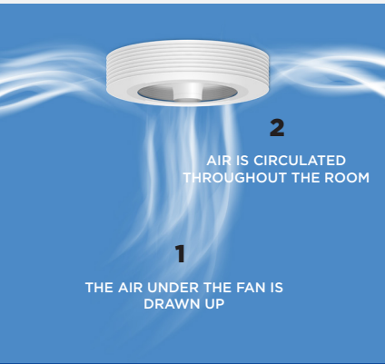
The fan's Vortex effect

The Typhoon wind vanes (removable) are incorporated between the fan blades and increase ventilation performance by 25 to 40%. The fan runs more slowly and consumes even less energy